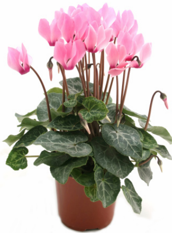
A potted cyclamen makes a great gift. It can bloom for quite a few seasons!

A potted florist's cyclamen makes a great gift, but is often thought of as a 'one-or-two-season' throwaway plant. In fact, if it is well cared for, it can grow and bloom for quite a few seasons. Correct temperature is a good start. In nature, cyclamens grow in cool, humid environments. They do not like warmth, if kept indoors, they should be kept in a well-lit room, free from heating. Alternatively, they can be kept outside on a well-lit balcony or verandah protected from the sun, or under a heavy foliage tree or a pergola. The next step is to make sure that they are properly watered as they are sensitive to both over and under watering. Make sure the pots have excellent drainage with a soil that holds water well. Water only when the soil is dry to the touch but don't wait until such signs as droopy leaves and flowers. When water, do it from below the leaves as water on the stems and leaves can cause them to rot. Next comes fertilizing, do it once every one to two months with water-soluble fertilizer mixed at half strength, too much fertilizer can affect the plant's ability to re bloom. Cyclamen are plants that spend part of the year in growth, and part of the year in a dormant state. During the dormant period (summer) they remain in the form of a subterranean tuber, which is in fact a swollen root. It looks very much like they are dying, as their leaves turn yellow and fall off. In fact,