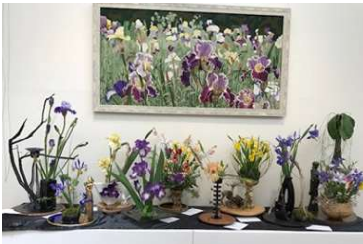
Display of floral art entries by Lorraine McMiles